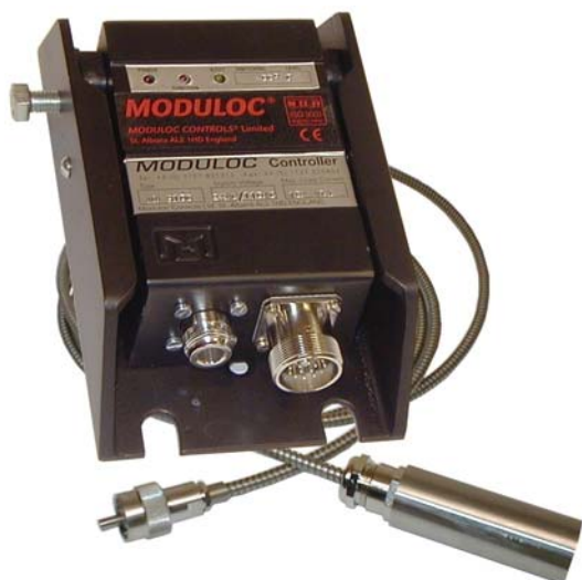
"ALL-IN-ONE" Remote Design utilizing 400°C Optic Leads & Remote Lenses.