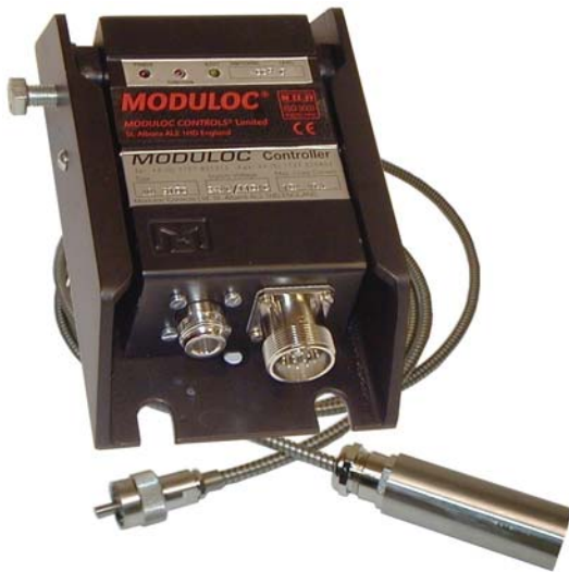
"ALL-IN-ONE" Remote Design utilizing 400°C Optic Leads & Remote Lenses.