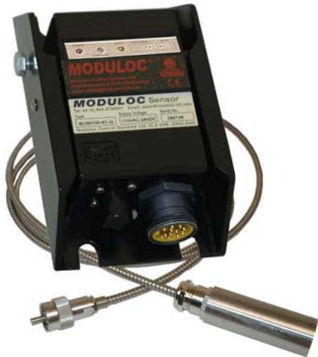
"ALL-IN-ONE" Remote Design utilizing 400°C Optic Leads & Remote Lenses.