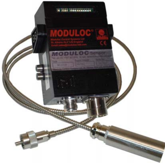
"ALL-IN-ONE" Remote Design utilizing 400°C Optic Leads