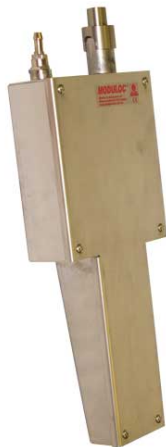
MDCLS400R300-RB & MDCLS700R400-RB